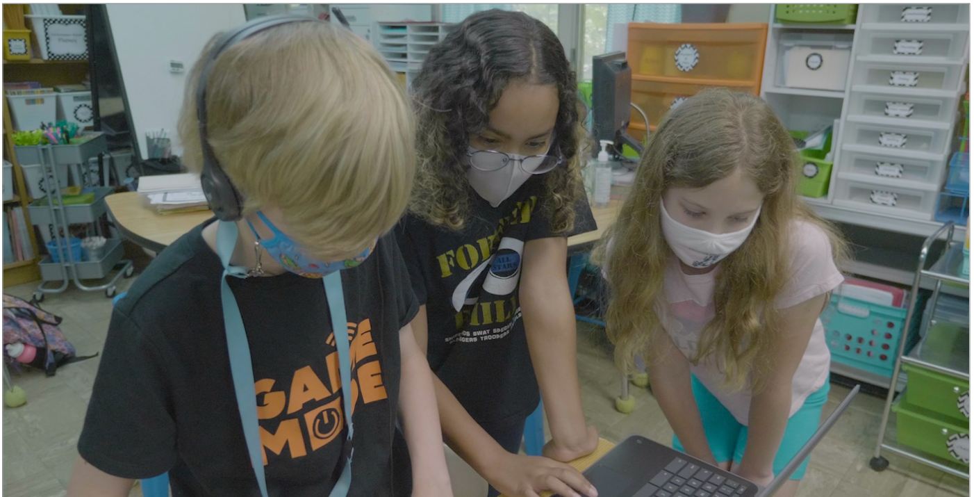
Figure 2. Students from the Central Dauphin School District work together on creative problem solving while completing the Starter Pack activities.