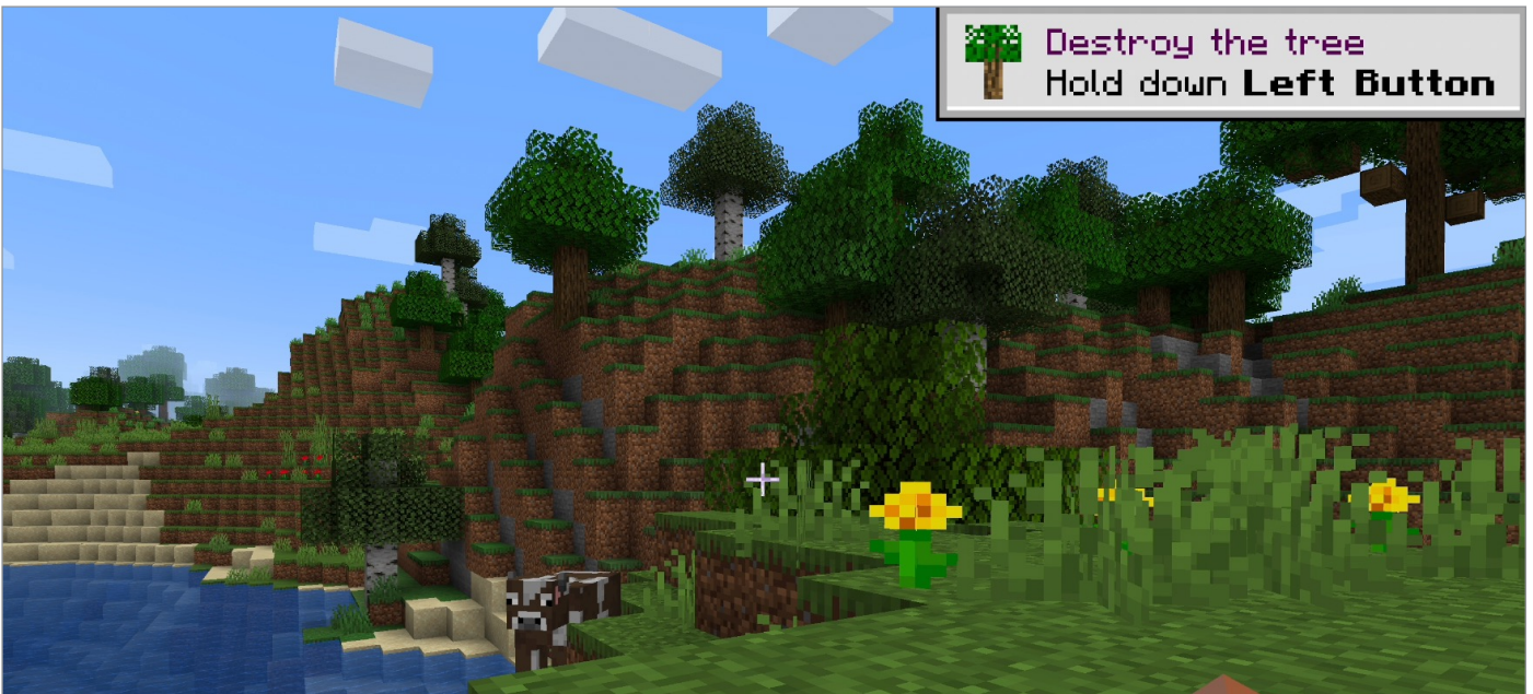
Figure 3. In the Starter Pack “Agriculture Farm to Table”, students are tasked to build an Agricultural system on Minecraft.

For more information, visit skillsforinnovation.intel.com